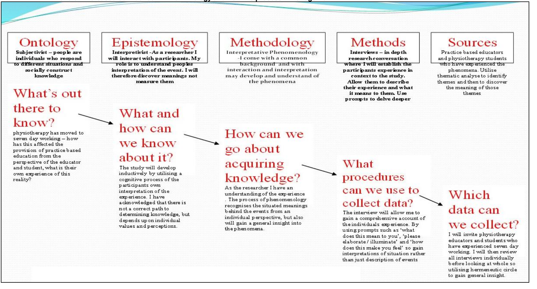
Figure 6. This diagram demonstrates my understanding of my philosophical stance within research and an increased confidence with terminology and how the process links together.

International Journal of Practice-based Learning in Health and Social Care Vol. 4 No 1 July 20165, pages 78-87